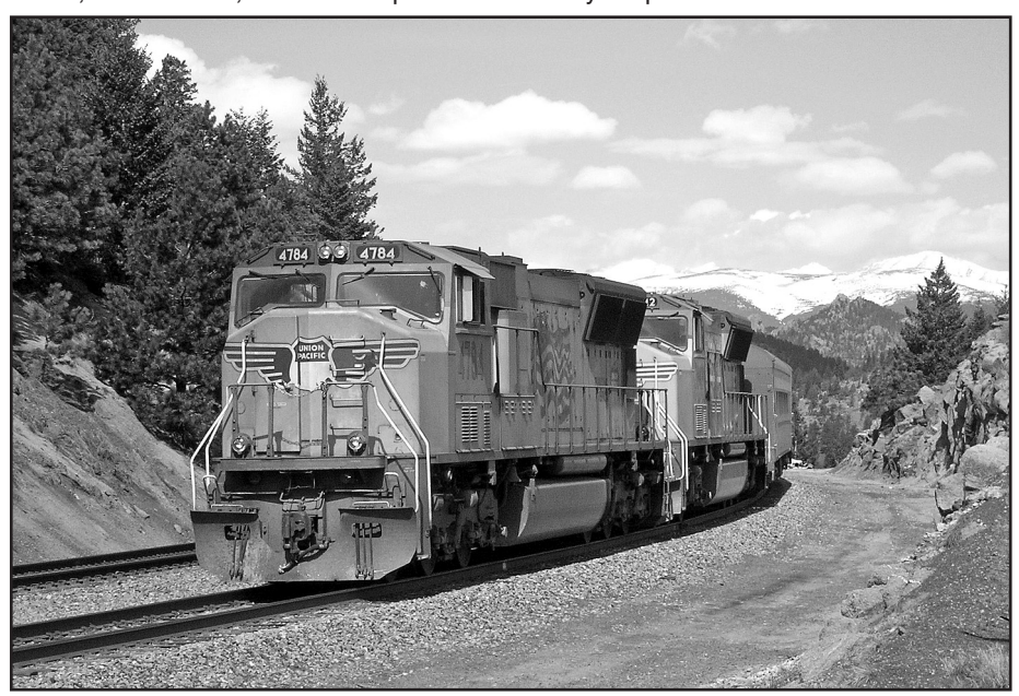
UP SD70M 4784 and 3842 led an Oakland, CA, to Council Bluffs, Iowa, 12-car S OACB 12 east over the Moffat Tunnel line 4/2/07. Train was held at Crescent Siding near Gross Reservoir for 40-minutes due to a rock falling into the slide fence. Maintenance of way was called to check out the rock size and proximity to the track.