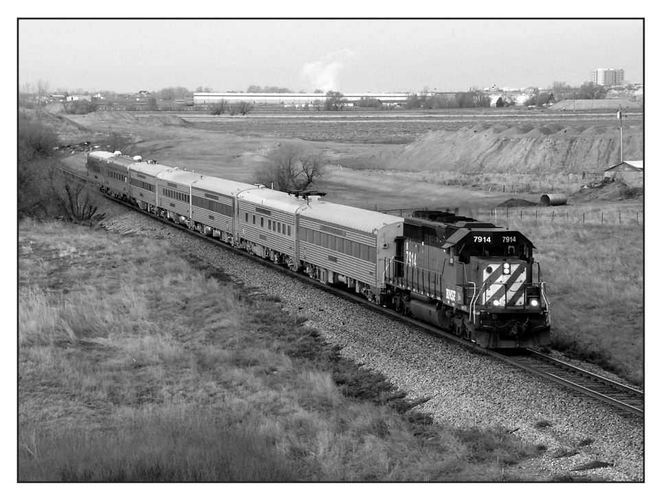
The seven car BNSF Officer Special eastbound at Tonville, Colorado.