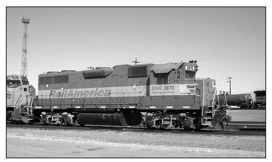
RailAmerica owned GP38 lettered Esquimalt & Nanaimo Railway 3870 was moved from Vancouver Island in Canada headed for a RailAmerica shortline at Fresno, California. BNSF handled the unit which departed Denver mid-April on the Denver to Belen, New Mexico, train.