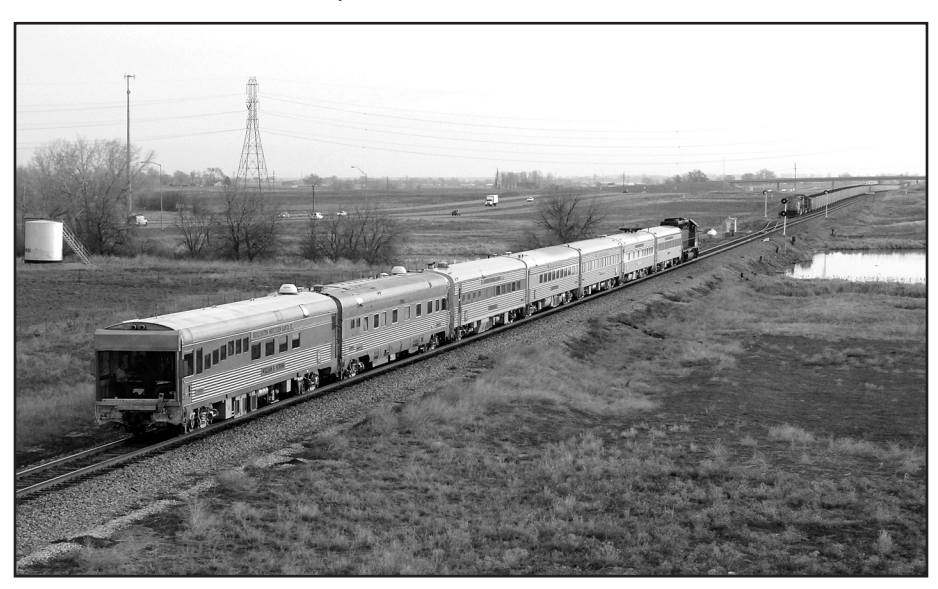
Track inspection theatre lounge car WILLIAM B. STRONG trails the BNSF Officer Special at Tonville, Colorado, as the train approaches a westbound coal train in the siding.