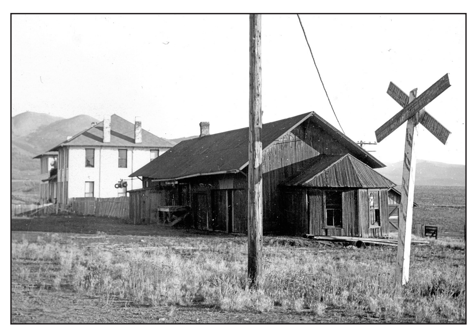
The "track side" of the Como depot and hotel as it was on September 25, 1940.