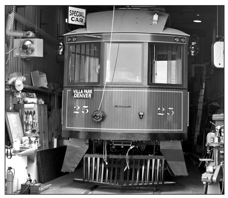
No. 25 in the "Car Barn" at the Denver Federal Center.

ing this magnificent piece of equipment restored, completely, will be a very exciting anniversary celebration. To have gotten this far would not have been possible without your steady financial support along with matching donations from employers such as Xcel Energy, US West (Qwest) and the grant from the Union Pacific. Unfortunately, the program guidelines of some companies such as Union Pacific have changed to not include our requests. This makes your individual donations even more important to our restoration endeavor.